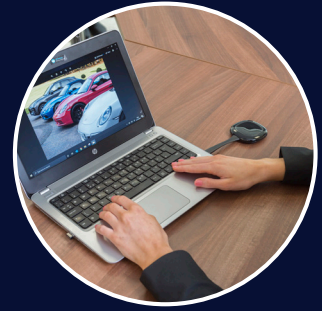
Connect to CleverCast with one tap