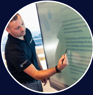
Collaboration Tools at your fingertips