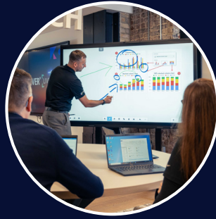
Enhanced Boardroom Collaboration